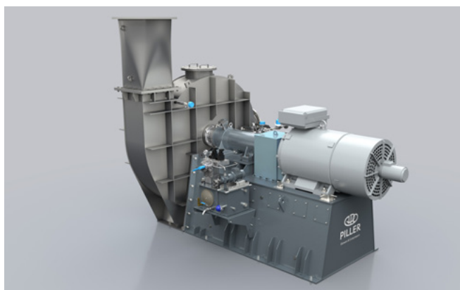
PILLER industrial air blowers are used in industries where higher air flow at high pressure rise is required