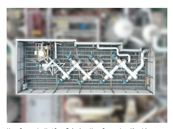
Vapor Compression Heat Pump Technology: Vapor Compression with serial connection of eight VapoFlex

To find the ideal match for your process conditions we customize impellers, housings, materials, and bearings to accommodate the desired volume flow, required pressure and temperature rise for the ideal solution for your process requirements. Our customized VapoFlex are designed to support the reduction of operating costs and increase the lifetime of your plant.