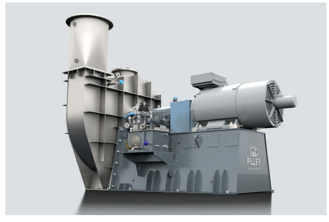
VapoFlex - Engineered-to-Order (ETO)