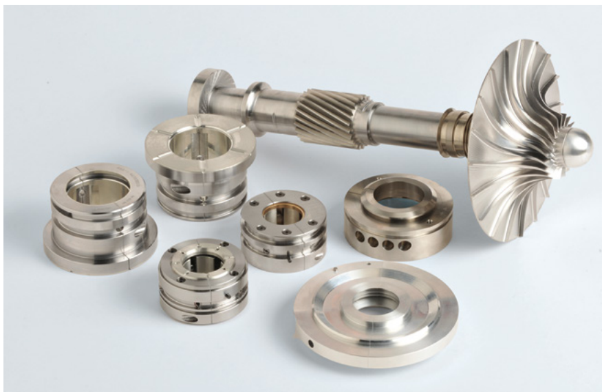
Rotor, bearings and seals

The object of finite element analysis (FEA) is to evaluate the stress levels of components. Using FEA coupled with sound engineering judgment, choices can be made about: material selection, heat treatment, performance characteristics, stress levels and impeller displacement at operating speed.