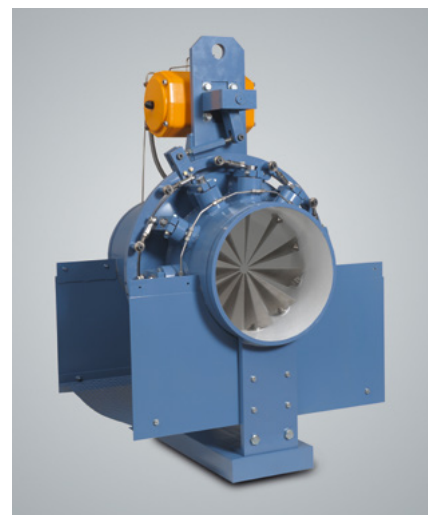
Inlet Guide Vane (IGV)

Visit our website to find worldwide Sales & Service contacts