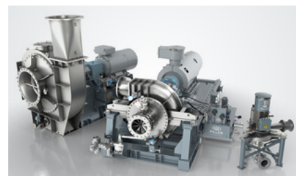
PILLER VapoLine – Blowers and Compressors specially engineered for vapor compression

With the VapoLine product portfolio, PILLER provides the perfect range of options to save energy and reduce carbon emission, demonstrating its competence as an expert in vapor compression technology.